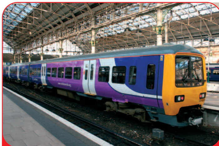
There will be winners and losers from timetable changes